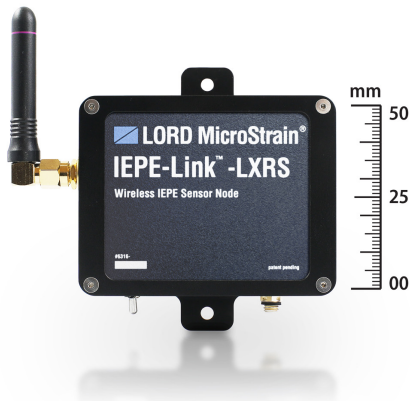
IEPE-Link™-LXRS® - specialized high-speed node designed for synchronized, periodic burst sampling of piezoelectric devices

LORD MicroStrain® LXRS® Wireless Sensor Networks enable simultaneous, high-speed sensing and data aggregation from scalable sensor networks. Our wireless sensing systems are ideal for sensor monitoring, data acquisition, performance analysis, and sensing response applications.