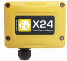
X24-ACMi-SA ATEX / IECEx Telemetry Strain Transmitter Module