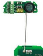
X24-SAe ATEX / IECEx Telemetry Strain Transmitter OEM Module