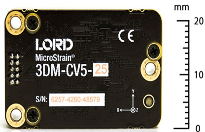
3DM-CV5™-25-miniature, industrial-grade attitude and heading reference system (AHRS) with integrated magnetometers, high noise immunity, and exceptional performance

The LORD Sensing 3DM-CV5 family of industrial-grade, board-level inertial sensors provides a wide range of triaxial inertial measurements and computed attitude and navigation solutions.