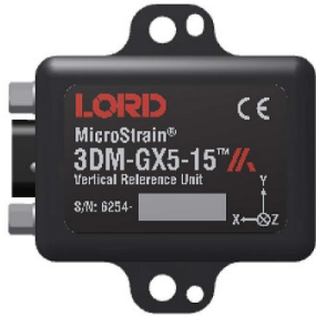
3DM-GX5-15 - miniature, high-performance, industrial-grade inertial measurement unit (IMU) and vertical reference unit (VRU)

The LORD Sensing 3DM-GX5 family of high-performance, industrial-grade inertial sensors provides a wide range of triaxial inertial measurements and computed attitude and navigation solutions.