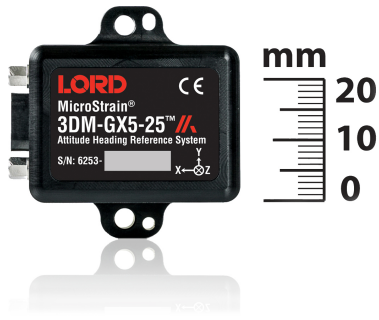
3DM-GX5-25 - miniature industrial-grade attitude and heading reference system (AHRS) with integrated magnetometers, high noise immunity, and exceptional performance

The LORD Sensing 3DM-GX5 family of industrial grade inertial sensors provides a wide range of triaxial inertial measurements and computed attitude and navigation solutions.